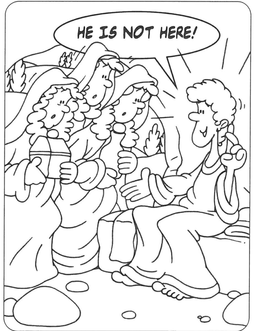
You seek Jesus of Nazareth, who was crucified. He has risen! Mark 16:6

Permission to copy granted for one-time use on March 31, 2024, only.